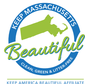
Founder & Executive Director Keep Massachusetts Beautiful

Please keep in mind that no two KMB chapters are exactly alike. Each chapter leader has different levels of ambition and each community has its own unique challenges to tackle. As you consider getting started on your journey with Keep Massachusetts Beautiful, remember that our system is highly flexible. The only requirement we have of our local chapters is that they "take action to make their communities cleaner, greener places to live, work, and play."